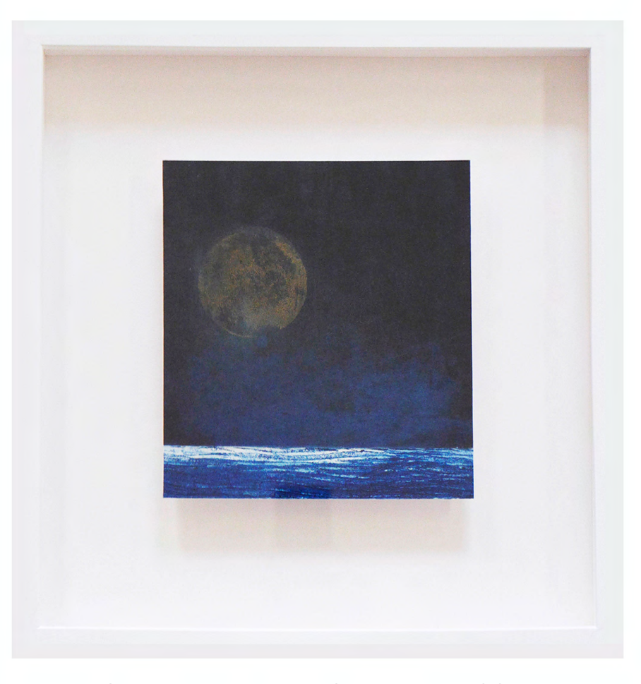
Angelica Bergamini, Fra Mare e Cielo (Between Sea and Sky) , 2020, mixed media, monotype, collage on paper, 11 x 11 inches framed