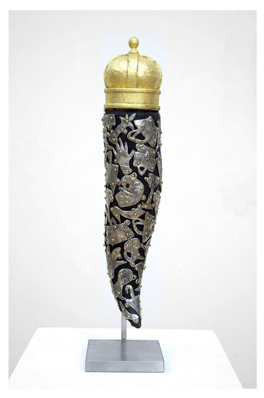
Claudia DeMonte, Il Corno , 2013, pewter and gold leaf on wood, 14 x 3 x 3 inches