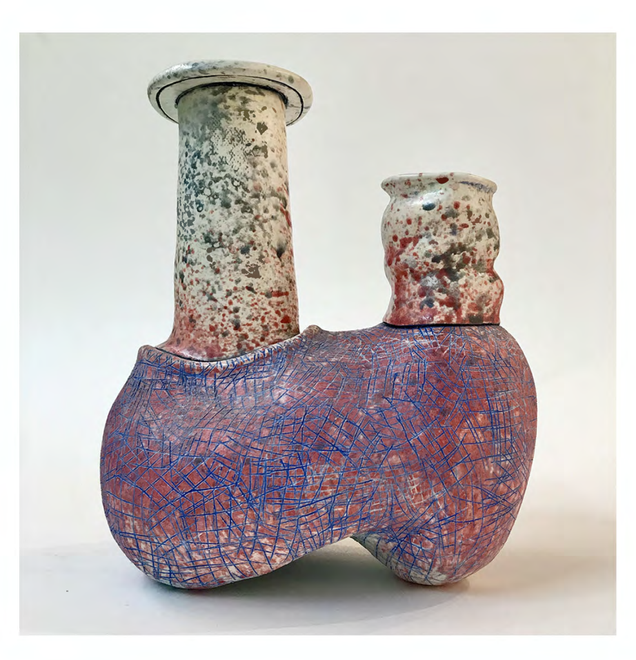
Elisa D'Arrigo, Double Dyad , 2010, hand-built and glazed ceramic, 8.5 x 12 x 7 inches