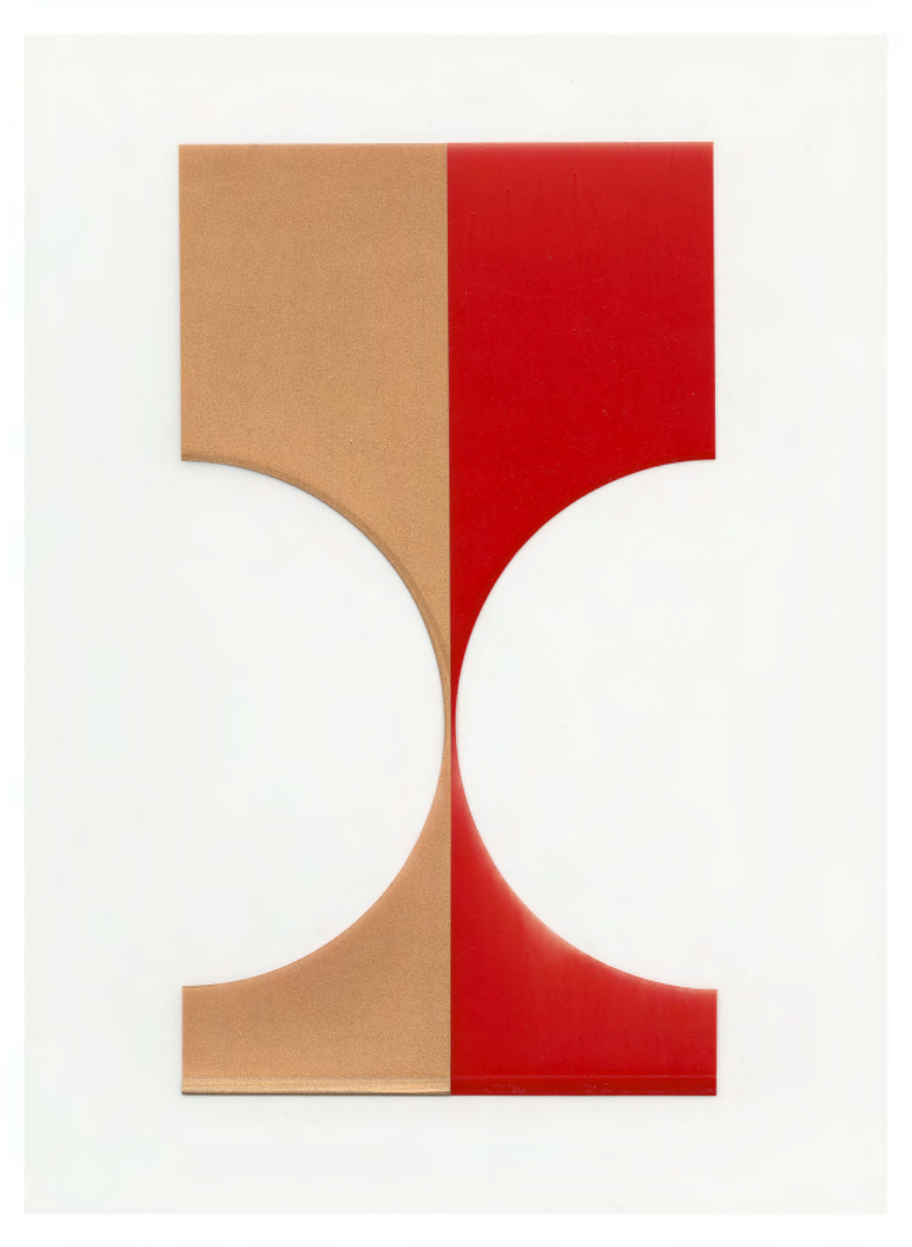
Mary Schiliro, Dip Drip Snip 5 , 2020, acrylic on Mylar, 15 x 11 inches