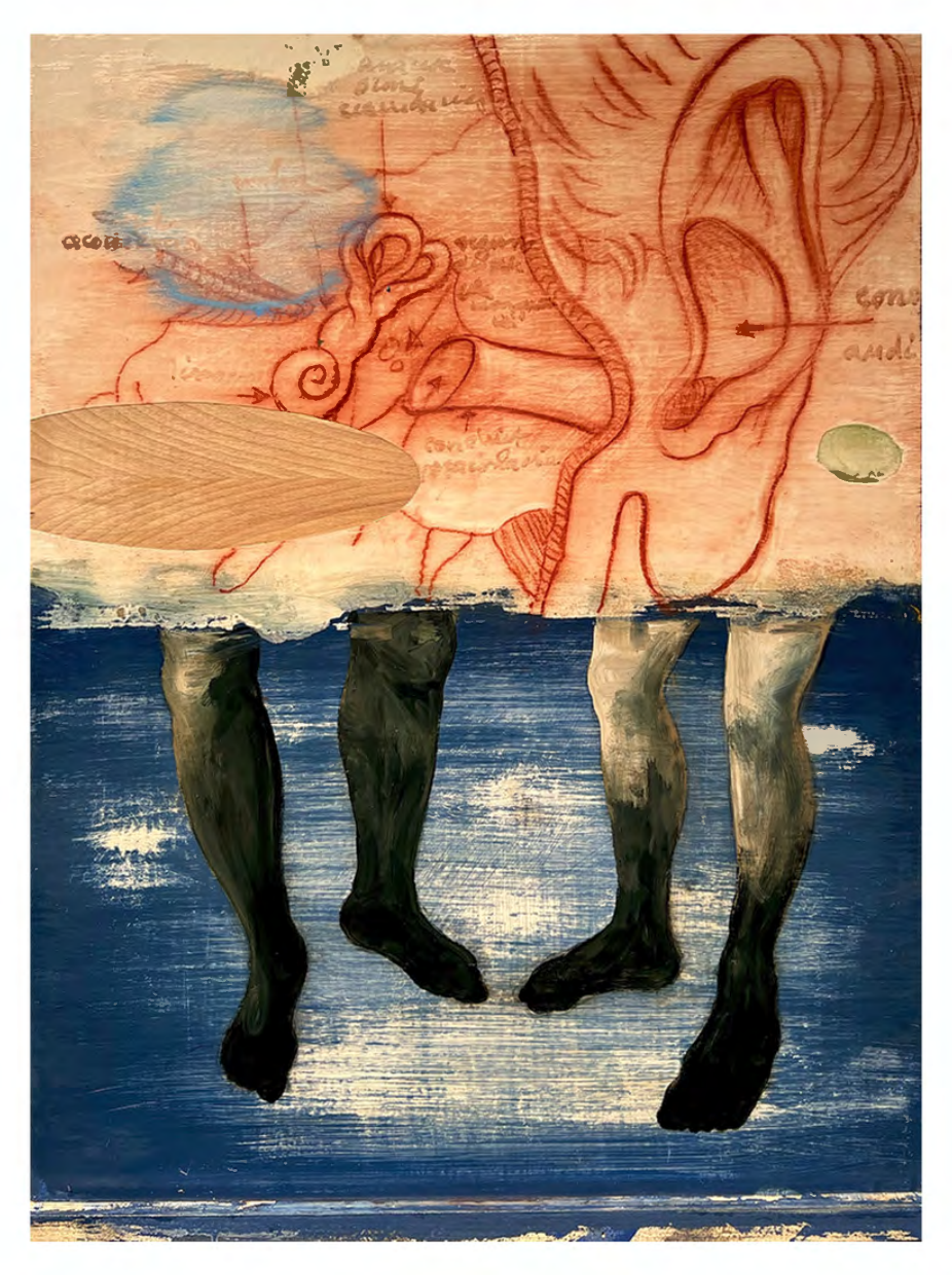
Timothy McDowell, Siren's Call , 2023, oil on panel, 24 x 18.5 inches