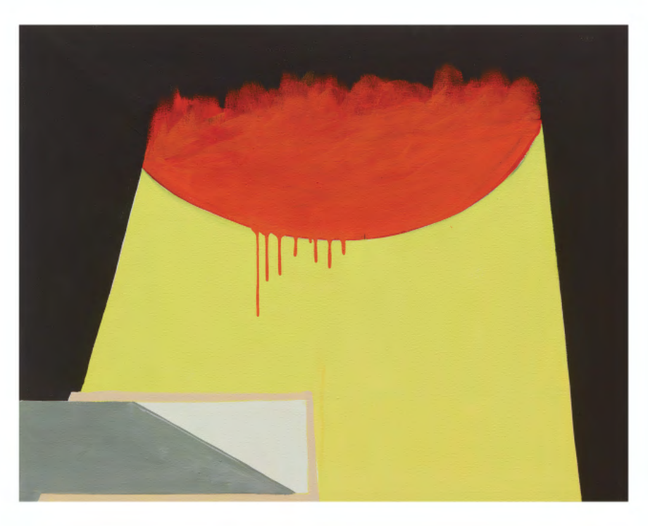
Karen Schifano, Something's Brewing , 2022, flashe on canvas, 28 x 36 inches