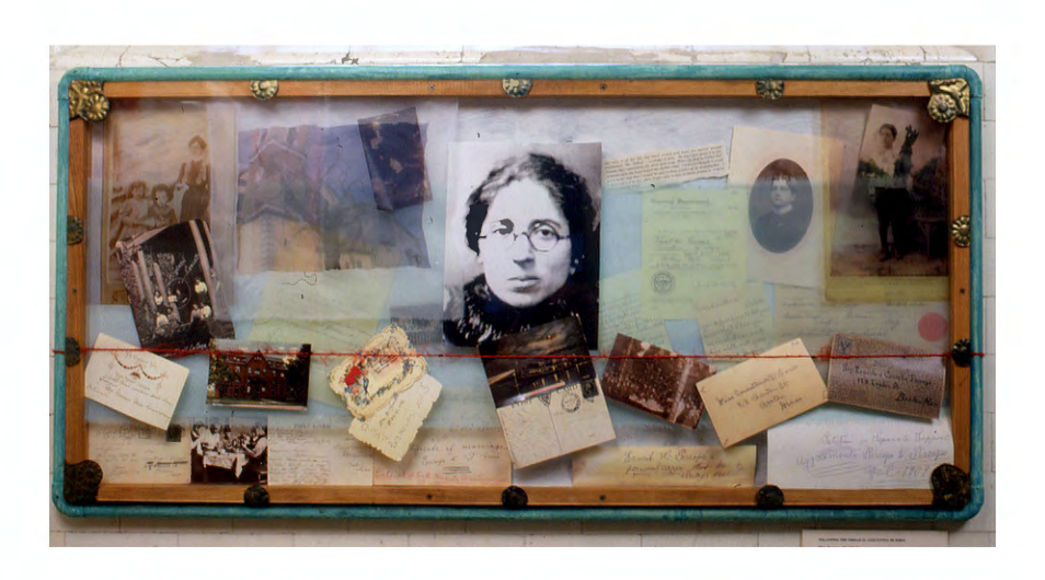
B. Amore, Following the Thread IV: Concettina De Iorio , 1999, copper, wood, photo, fabric, thread, 24 x 48 x 3 inches