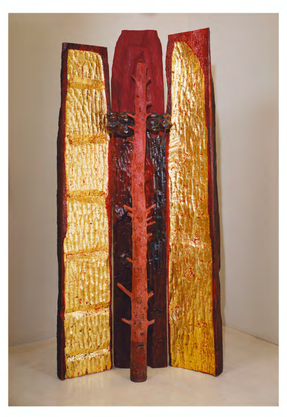
Nancy Azara, Tree Altar , 1994, carved and painted wood with gold leaf, 60.5 \times 36 \times 12 inches