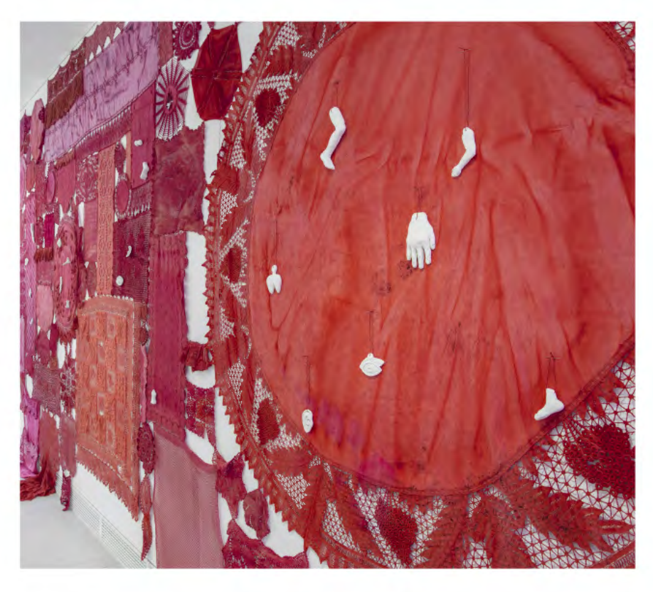
Patricia Miranda, detail of Lamentation for a Reasoned History , 2022, vintage lace hand dyed with cochineal insect dye, ex-votos in plaster and paper clay, thread