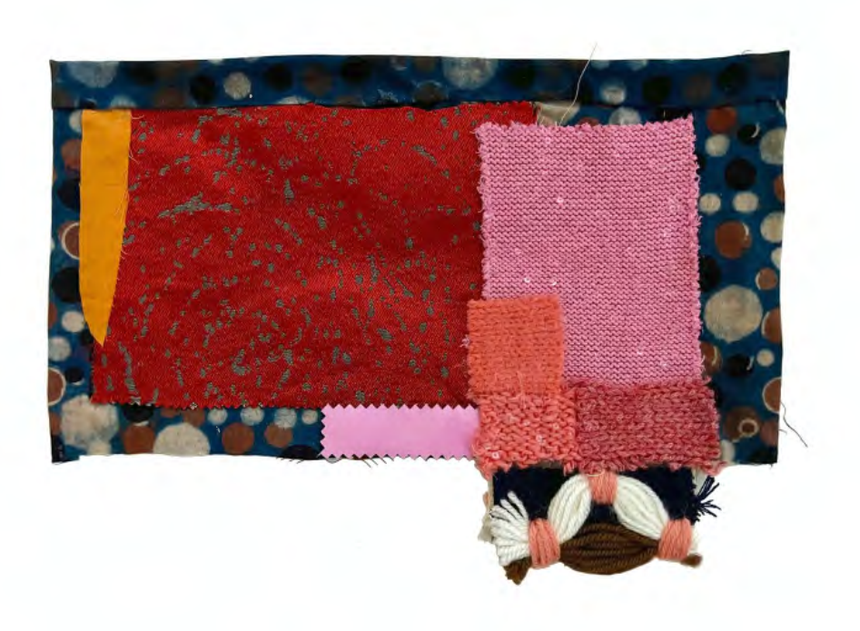
Chris Costan, I Believe 4 , 2023, textile pieces and mixed media on paper, 11 x 13 inches