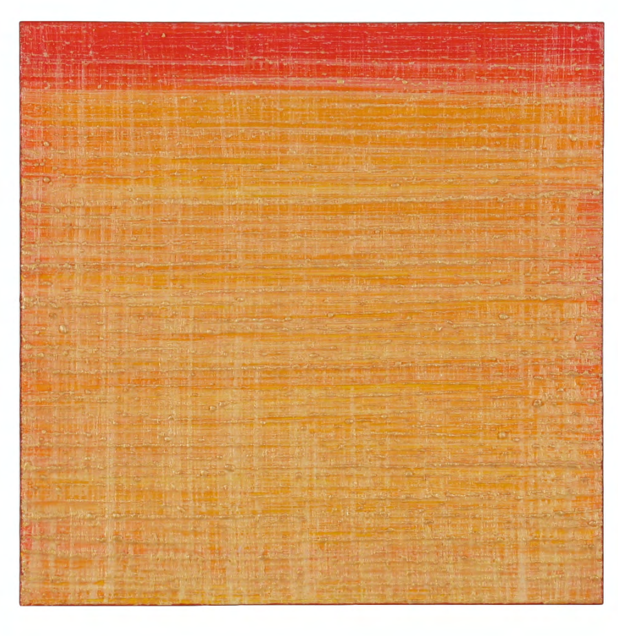
Joanne Mattera, Silk Road 338 , 2016, encaustic on panel, 12 x 12 inches