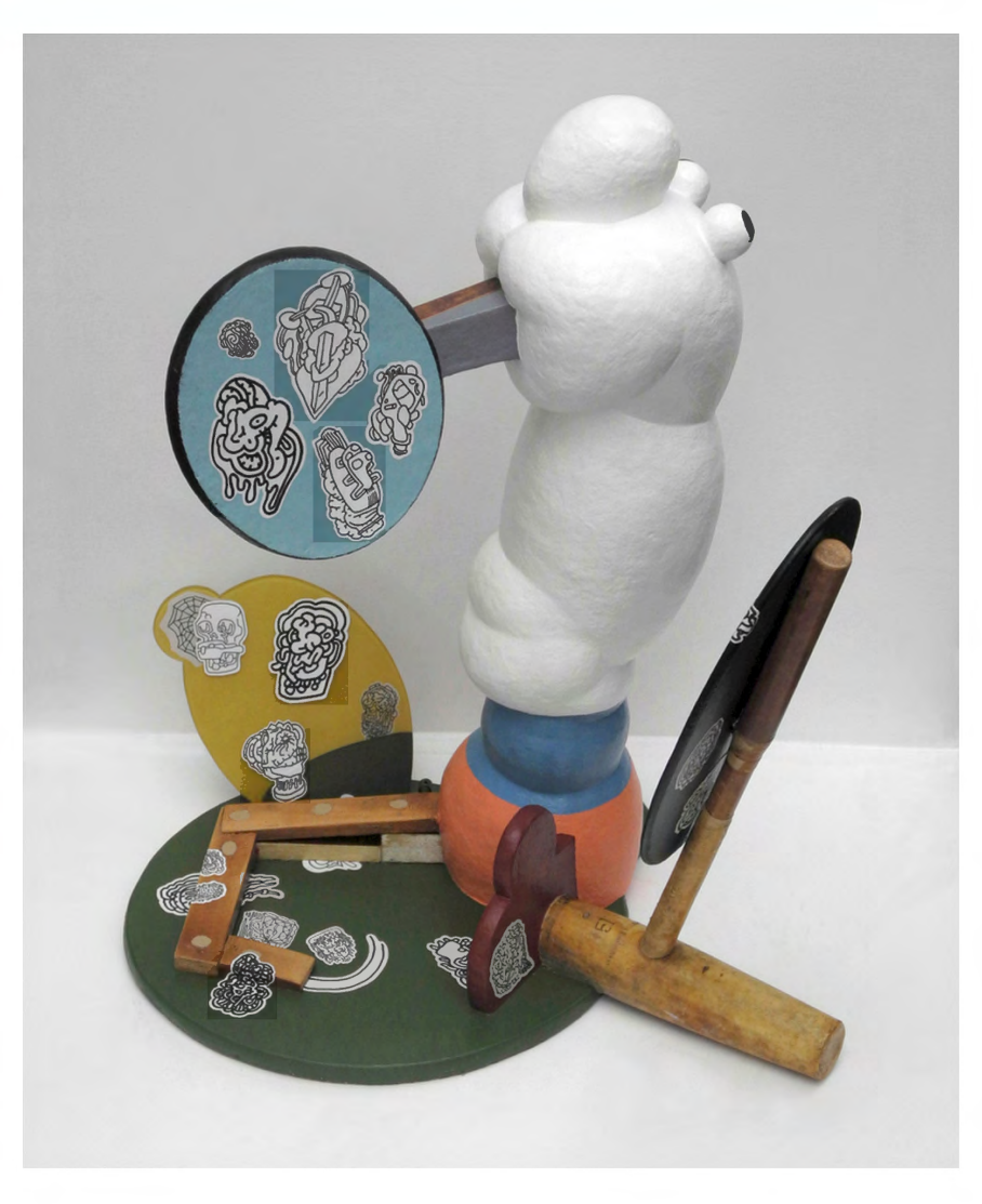
D. Dominick Lombardi, CCWS 28 , 2018, sand, wood, papier-mâché, gesso, plexiglass, piano keys, chair leg, acrylic medium, acrylic paint, objects, 21.5 x 20 x 14 inches