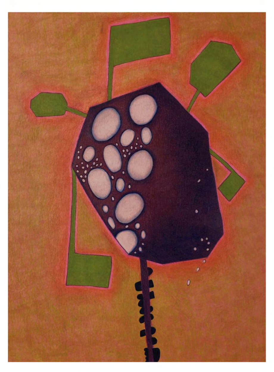
Denise Sfraga, Fetish augusta 6 , 2021, colored pencil on paper mounted on panel, 12 x 9 inches