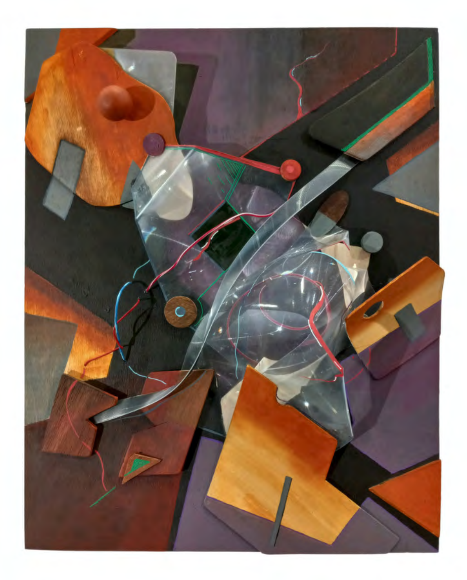
Gianluca Bianchino, Bubbleverse—Outward Orange , 2022, mixed media, 16 x 20 x 5 inches