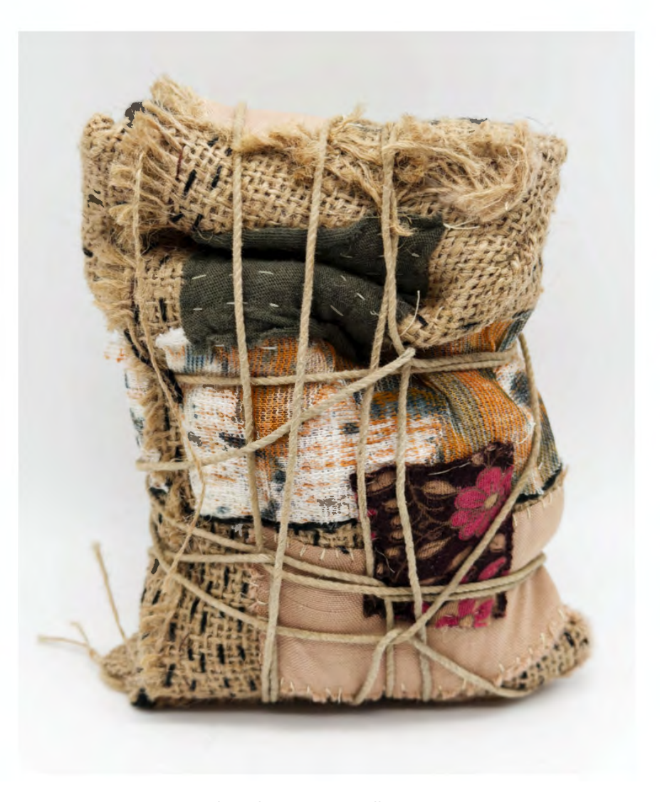
Lisa Zukowski, No. 12 (Bundle Series) , 2015, mixed media (burlap, textile, encaustic monotype on cloth, old clothes, embroidery, string), 4.5 x 6 x 2 inches